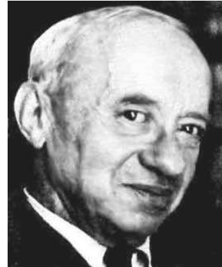
Alfred Tarski - Poland 1902-1983